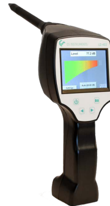
LD 450 with straightening tube and straightening tip for accurate detection.