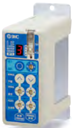
Programless type Series LECP 1/2 I/O input type Series LECP6