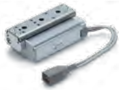
Electric Slide Table Series LES