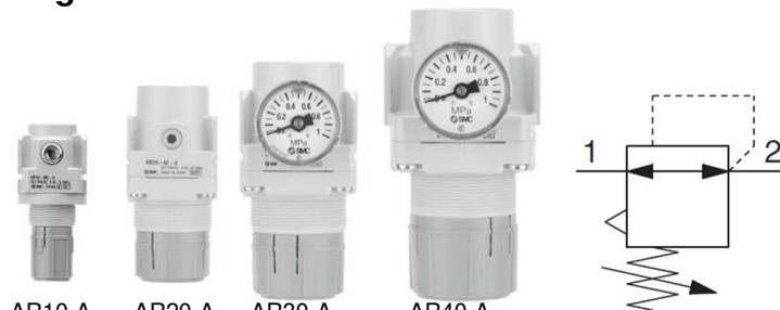
AR10-A AR20-A AR30-A AR40-A

The intended use of this product is to regulate the air pressure in the pneumatic circuit.